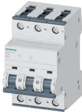
Miniature circuit breaker 400 V 10kA, 3-pole, B, 32 A, D=70 mm